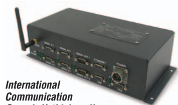
International Communication Group's NxtLink mail server

"sky"), it is being promoted as a lighter, smaller and less expensive alternative to the Air-cell/Thrane & Thrane product.