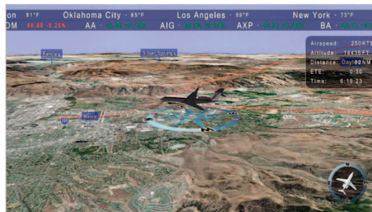
Honeywell's highly detailed HD moving map display shows where the aircraft in relation to highways, cities and terrain.

Like Forté AirMail, it operates through the Iridium satellite net-