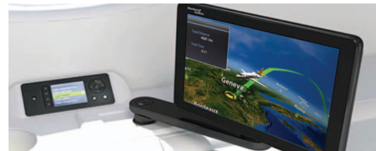
Rockwell Collins Venue continues to evolve even as the company gears up for first deliveries for the new Citation CJ4.

work and will interface with existing Aero H satcom systems. Sky Berry permits global e-mail service and mobile Web browsing for up to 10 passengers simultaneously and supports BlackBerry Internet Service, BlackBerry Enterprise Server, Yahoo Mail, Hotmail and Gmail.