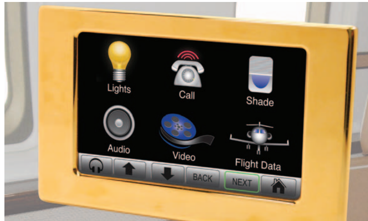
Flight Display Systems is new to the full cabin management system market and emphasizes simplified, user-friendly controls.

It is unlikely there will ever be a completely seamless transition from home or office to the aircraft cabin, but it remains a worthy goal. “We’ll never really get there,” predicts Aircell’s Jay Wade. “But we’ll get close.” □