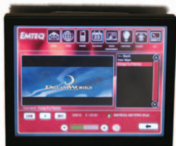
Emteq’s SkyPro touchscreen

The all-digital system components work independently of an aircraft’s existing CMS, and