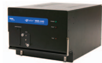
EMS Satcom's HSD 440

ENfusion HSD-XI adds one SwiftBroadband and one Swift 64 channel to the company's HSD-440 high-speed data transceiver. The combined system results in a dual-channel SwiftBroadband that also offers classic services.