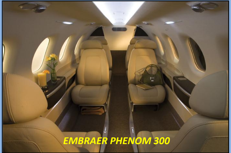
EMBRAER PHENOM 300